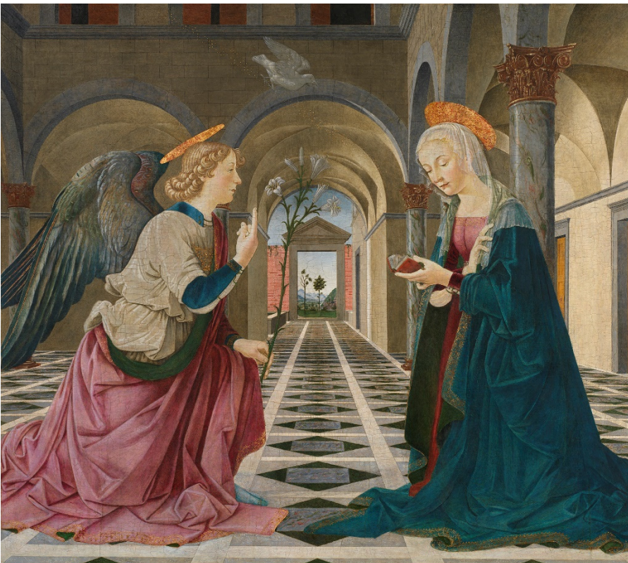
Source 2: The Annunciation by Piermatteo d'Amelia, c. 1487. Isabella Stewart Gardner Museum, Boston.